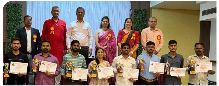
All winners with guests & top management.